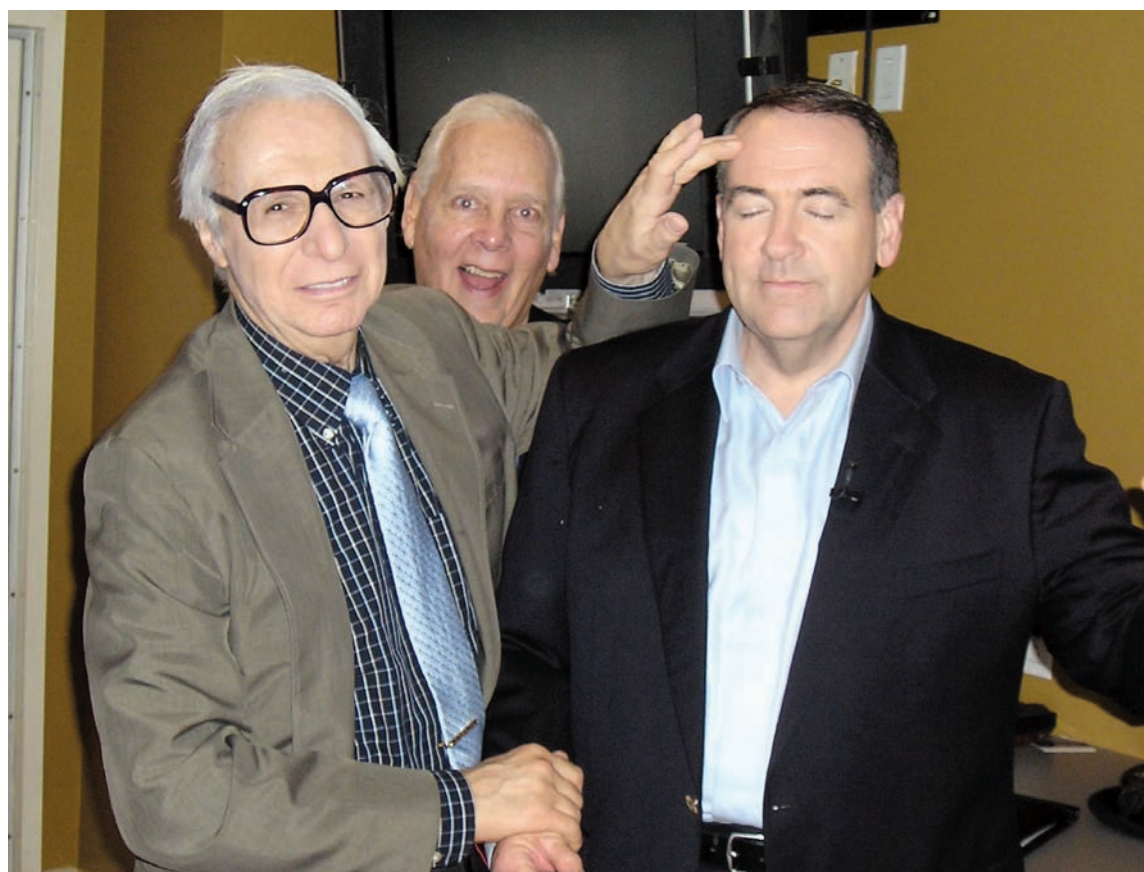
MR. KRESKIN with former Republican Presidential candidate Mike Huckabee.

at the Oregon State Fair. After I found it you could have wiped me off the floor.